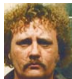
Mugs in the news