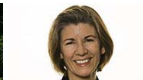
Need advice? Ask Amy