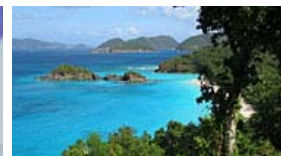
Your travel photos